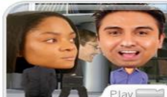
One-Stop College Shop