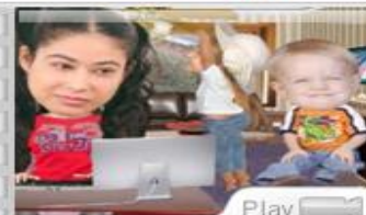
Plan 4 College :-)